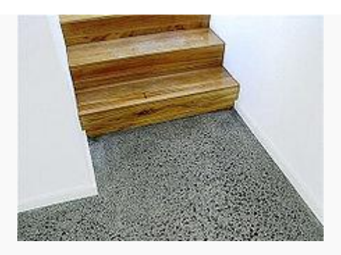
New polished concrete floor